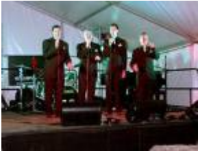
FREEFALL in concert at Bundaleer Weekend Arts Festival