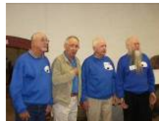
A Song in the Shed from Sparring Partners