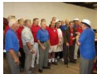
A Song in the Shed at Kay Bothers Winery

On Saturday, members and partners relaxed with an all-day coach trip to the beautiful Southern vales wine district. We first enjoyed browsing stalls and sampling local produce at the Willunga farmer's Market. We then were joined by our South Australian friends in a picnic barbecue lunch at Kay Brothers Amery winery. Lunch was followed by more singing in the taproom. The Festival Statesmen are to be commended for organising this excellent trip.