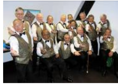
Westcoast Chordsmen Warming Up for the Concert

Combined Men's and Ladies Chorus Perhaps Love